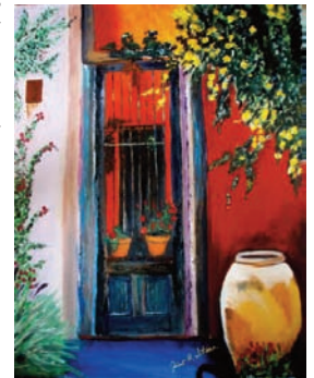
Tucson Presidio 16" x 20", Oil

I am relatively new to the art of painting. However, I have appreciated, from an early age, the work of the artists throughout the centuries, and was always fascinated when watching artists