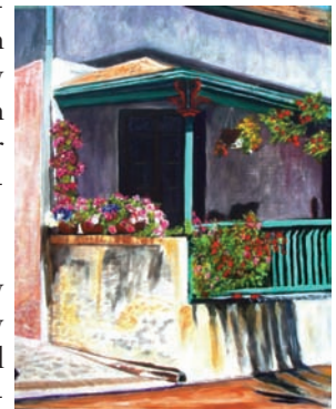
Corner Market 16" X 20", Acrylic

I work for the most part from my own photos, and I am particularly drawn to architecture. I have traveled to many different countries capturing the beauty of their landscapes and buildings on camera, and focus on these images for much of my work. I welcome commissioned projects and have completed several of them for local clients.