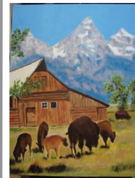
Buffalo Grazing 20" X 24", Acrylic

My skills have been acquired mainly though local workshops with Diane Bonaparte and experimentation with the different mediums. My work has