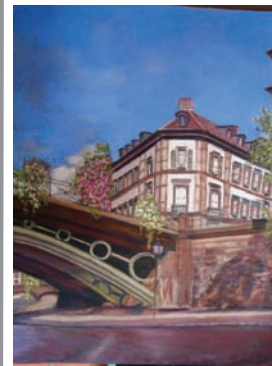
Strasbourg Spring 22" X 25", Soft Pastels

I am still evolving and hope to enjoy many more years doing so.