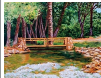
Murphy's Park 11" X 14", Oil