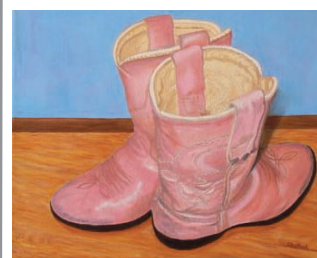
Pink Boots 11" X 14", Oil

enjoy creating works of art and sharing them with others, I have sold some of my works to friends. I joined the SLFA in hopes of getting more exposure and displaying my works in commercial establishments and galleries. I work mainly from photographs that have been taken on trips and outings. I enjoy working in oil and pastels's equally and work in each media every week.