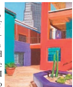
Plecito Downtown 11" X 14", Pastel