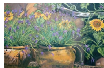
Jirasoles 24" X 36", Acrylic

member of the Market Place downtown. I have participated in various juried art shows in Phoenix as well as Tucson and have done demonstrations in both cities as well. My favorite way to express my art is through colorful renditions of Mexican and South-western motifs, everything Tucsonan and portrait painting is also a favorite venue.