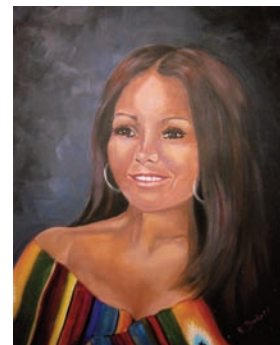
Dulce 16" X 20", Acrylic