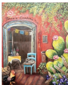
Rosa's Cantina 30" X 24", Acrylic

My interest in acrylics began while I was taking a course in Real Estate ap-