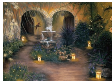
Luminarias 26" X 48", Acrylic

I am currently showing at Centro Cultural de Las Americas at 40 W. Broadway, Galleria CALI at 825 E. University Blvd. and at Buhardilla Home Design at 2360 E. Broadway, and at Tombstone Boarding House Bed and Breakfast Inn.