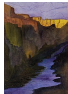
Last Light, 10" X 14", Watercolor

My experimentation with abstract and nonobjective pieces helps me to challenge my limits and explore the many facets of abstract painting, including nontraditional presentation formats. Nature is my starting place and I am enjoying growing as an artist and keeping the passion of painting alive for me and my viewers.