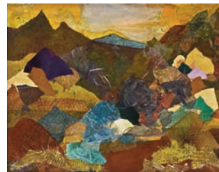
Mountain View, 11.75" X 15.75", Mixed Media

Currently I am a Board member of the Southern Arizona Arts Guild and Co-President of the Contemporary Artists of Southern Arizona.