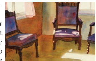
Late Afternoon, 13.25" X 16.75, Watercolor

Primarily working in water color and mixed media collage, my art reflects a longtime interest in the way color and shape can be used to evoke mood and to capture the beauty of the environment. My passion to bring forth art from real life has taught me to see with new eyes and to appreciate even